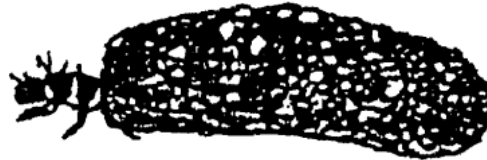
Larva with case