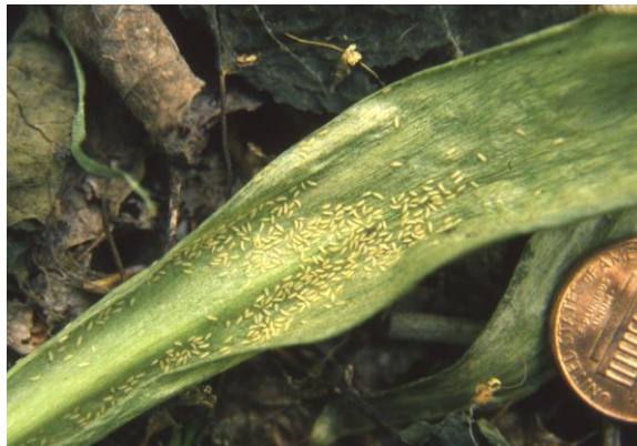
Pear thrips larvae clustered on a leaf on the ground, after being washed off the tree leaves by heavy rain, in late May, just prior to going underground to pupate.