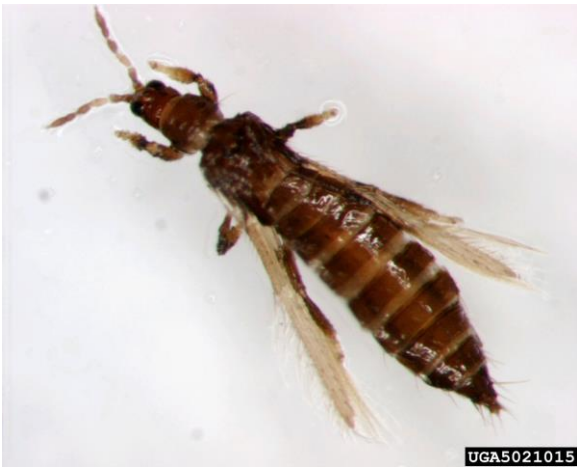
An adult pear thrips.