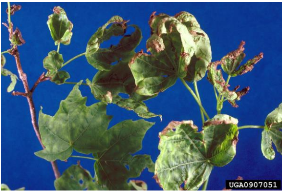
Maple leaf damage from Pear thrips

Taeniothrips inconsequens (Uzel); Family: Thripidae