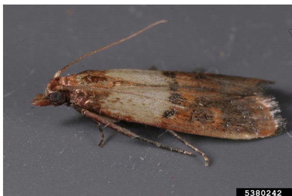
Adult (length less than 1/2 inch).