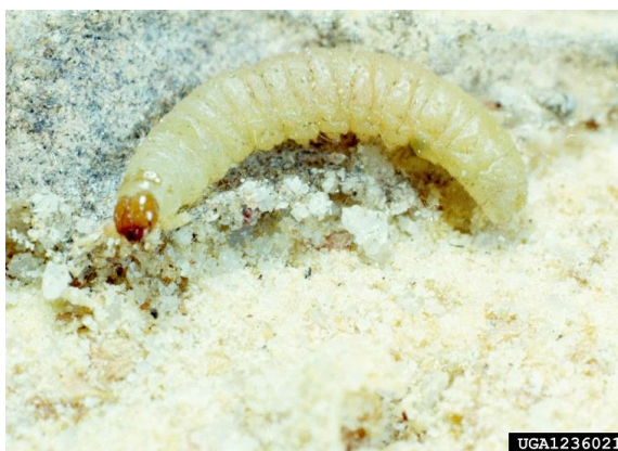
Larva (length about 1/2 inch).